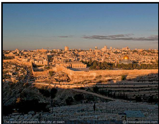
Jerusalem at sunrise