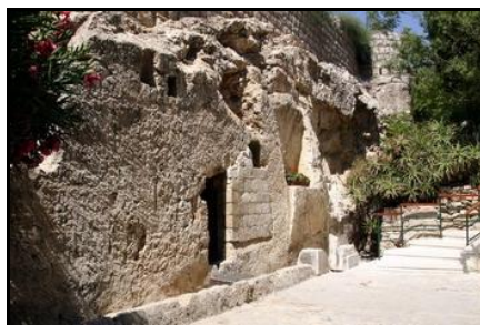
The Garden Tomb